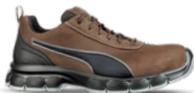
64.054.2 CONDOR BROWN LOW** S3L ESD FO SR