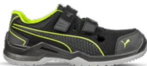
64.430.0 NEODYME GREEN LOW S1P ESD SRC