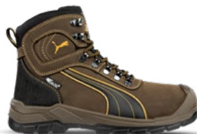
63.088.0 SIERRA NEVADA ST MID 02 WR CI HI HRO SRC