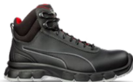
63.010.1 CONDOR BLACK MID** S3L ESD FO SR