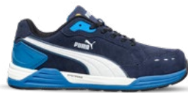
64.462.0 AIRTWIST BLUE LOW** S3 ESD HRO SRC