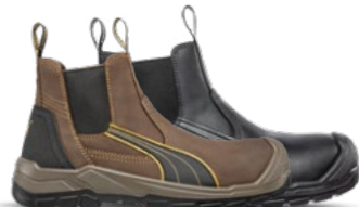
63.026.1 | 63.034.0 TANAMI BROWN | BLACK MID S3 CI HI HRO SRC