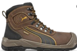
63.022.0 SIERRA NEVADA MID S3 CI HI WR HRO SRC