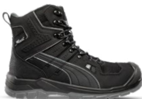
63.085.0 YOSEMITE BLK ST MID 02 CI HI HRO SRC