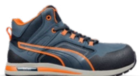
63.314.0 CROSTWIST MID S3S FO HRO SR