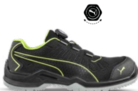
64.421.1 FUSE TC GREEN DISC LOW S1P ESD SRC