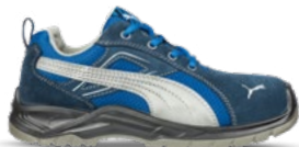
64.361.0 OMNI BLUE LOW S1P SRC