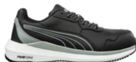
64.503.0 ZOOM LOW*** S3S ESD FO HRO SR