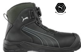
63.021.1 CASCADES DISC MID S3 CI HI HRO SRC