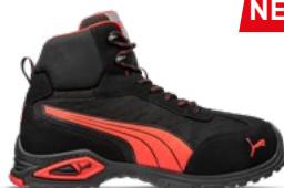
64.274.0 MADRID MID S1PL FO SR