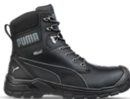
63.073.0 CONQUEST BLK CTX HIGH S3 CI HI WR HRO SRC