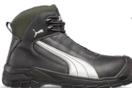
63.021.0 CASCADES MID S3 CI HI HRO SRC