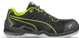
64.421.0 FUSE TC GREEN LOW S1P ESD SRC