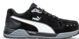
64.465.0 AIRTWIST BLACK LOW** S3 ESD HRO SRC