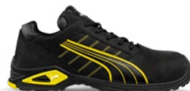
64.271.0 AMSTERDAM LOW S3L FO SR