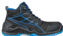
63.420.0 KRYPTON BLUE MID S3 ESD SRC