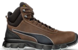
63.012.2 CONDOR BROWN MID** S3L ESD FO SR