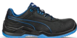
64.422.0 ARGON BLUE LOW S3 ESD SRC