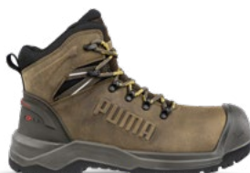
63.271.0 IRON HD BROWN MID S3S FO LG SR