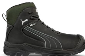
63.089.0 CASCADES ST MID 02 WR CI HI HRO SRC