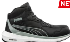
63.503.0 ZOOM MID*** S3S ESD FO HRO SR