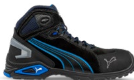
63.225.0 RIO BLACK MID S3L FO SR