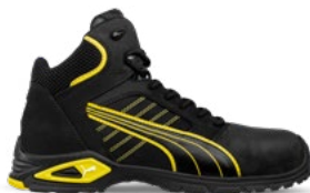
63.224.0 AMSTERDAM MID S3L FO SR