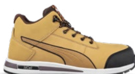
63.318.0 DASH WHEAT MID S3S FO HRO SR