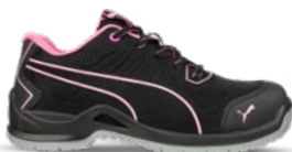
64.411.0 FUSE TC PINK WNS LOW S1P ESD SRC