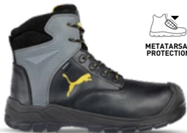
63.087.0 BORNEO MT MID S3 WR M AN CI HI HRO SRC