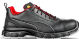
64.052.1 CONDOR BLACK LOW** S3L ESD FO SR