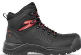
63.274.0 IRON HD BLACK MID S3S FO LG SR