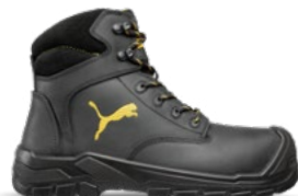
63.041.1 BORNEO BLACK MID S3 CI HI HRO SRC