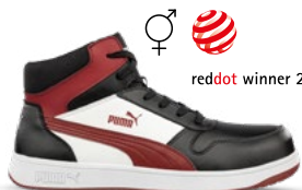
63.005.0 FRONTCOURT BLK/WHT/RED MID S3L ESD FO HRO SR