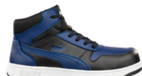
63.007.0 FRONTCOURT BLUE/BLK MID S3L ESD FO HRO SR