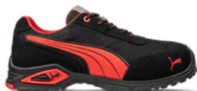
63.226.0 MADRID LOW S1PL FO SR