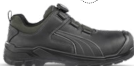
64.072.1 CASCADES DISC LOW S3 CI HI HRO SRC