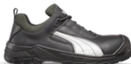
64.072.0 CASCADES LOW S3 CI HI HRO SRC