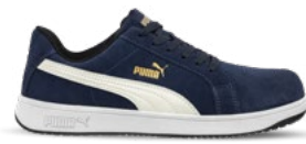
64.002.0 ICONIC SUEDE NAVY LOW S1PL ESD FO HRO SR