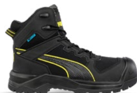
63.270.0 ROCK HD CTX MID S7S FO LG SR