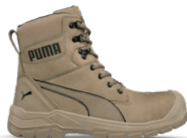
63.074.0 CONQUEST STONE HIGH S3 CI HI HRO SRC