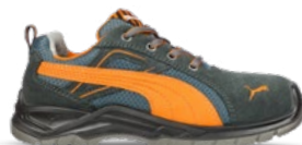
64.362.0 OMNI ORANGE LOW S1P SRC