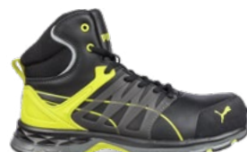
63.388.0 VELOCITY 2.0 YELLOW MID* S3S ESD FO HRO SR